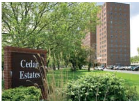
Left: Olde Cedar Estates, CMHA's first housing site, was constructed and occupied by residents in 1937 in Cleveland, Ohio.