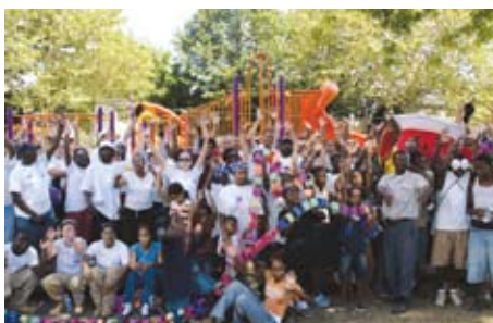
CMHA residents, staff and construction workers are all smiles after completing their new KABOOM playground last summer.