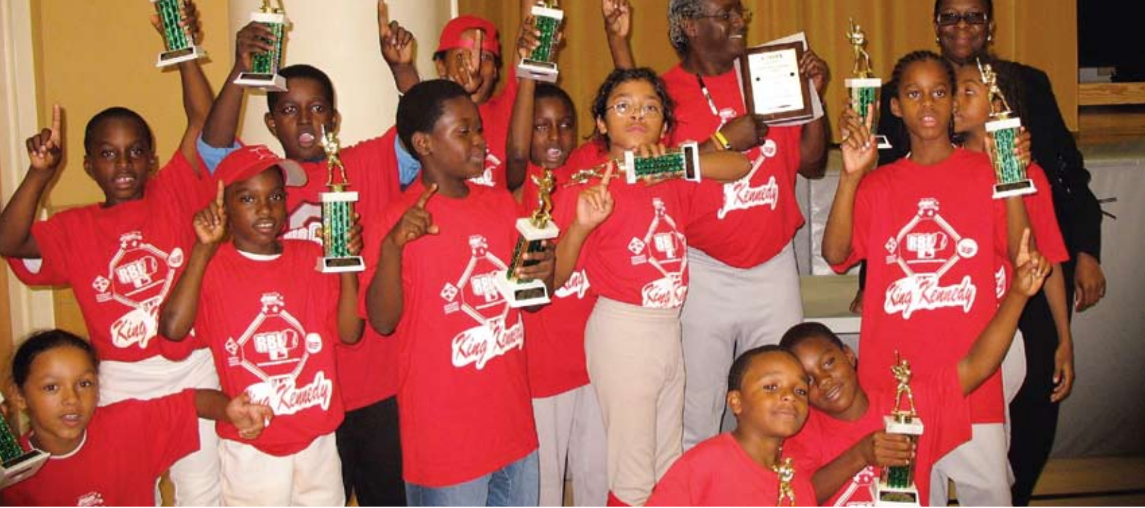
Children from CMHA's King Kennedy property are all smiles and proud of their accomplishments after clinching the championship trophy.